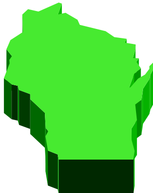
Answers to Puzzle 1: